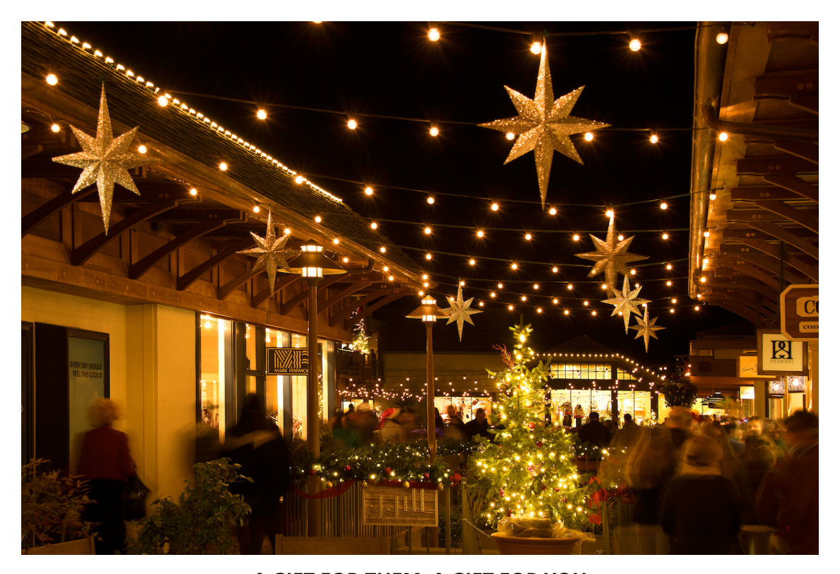
A GIFT FOR THEM, A GIFT FOR YOU

A weekend getaway between Thanksgiving and Christmas can help you catch your breath during a busy season — and help you catch up on holiday shopping. From Carmel-by-the-Sea to Healdsburg and beyond, these popular Northern California destinations are both great for getting bit of R&R and finding unique, locally-made gifts.