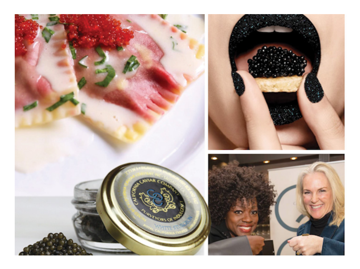
The first company committed to selling only sustainable, farmed caviar in the United