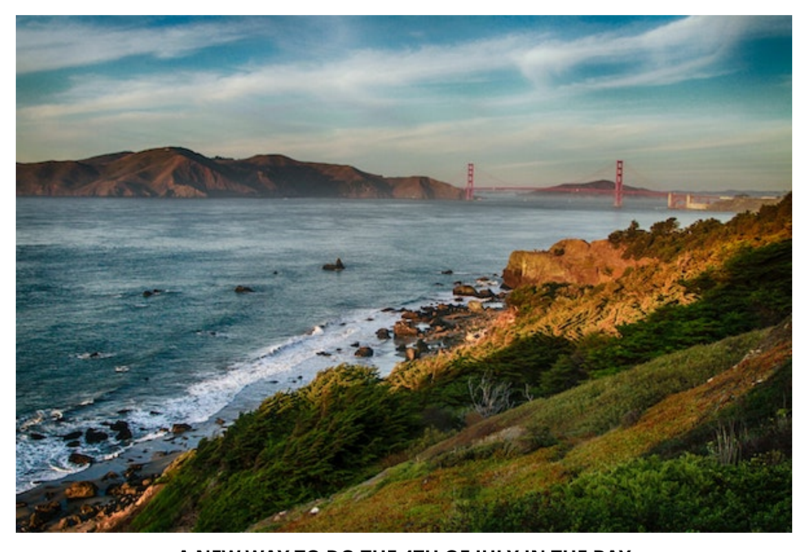
A NEW WAY TO DO THE 4TH OF JULY IN THE BAY

No fireworks? No problem. With higher temperatures and drought posing a risk for wildfires in California, how can we celebrate July 4th without putting our beautiful state at risk? We found some exciting alternatives to take advantage of this weekend in the Bay.